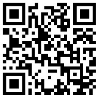
Summer 2023 Eastern Oregon USFS Interest Survey

In order to discuss your interests with a supervisor, please respond to this outreach. Your response is important. Please submit the electronic survey below or email your outreach response to the supervisor listed for each location (pg 8-14).